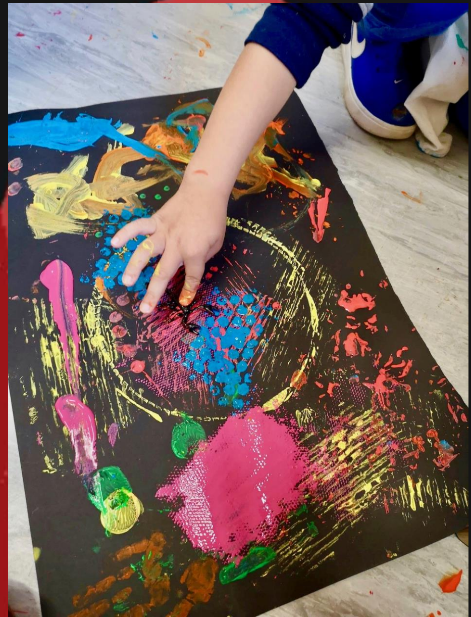
Nursery Art inspired from a post modernist exploration! Discovering artists like Pollock, Kandisky and many more!